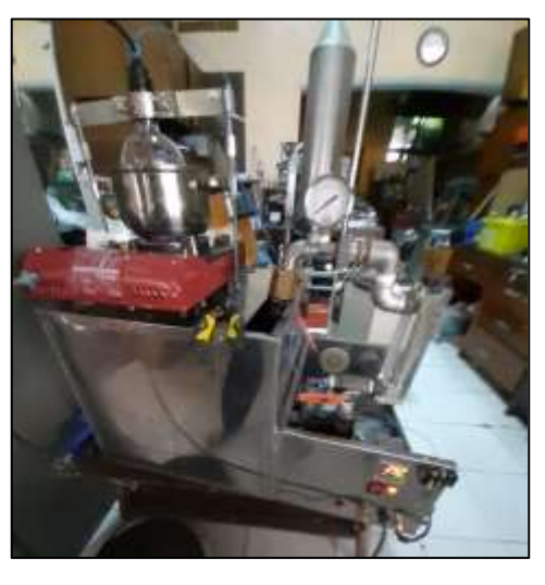
Fig. 2. The evaporator used to lower the moisture content in honey