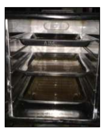
Figure 1. Dehumidifier use to decrease the amount of moisture content in honey sample

This research is focused in reducing the moisture content of honey using two different methods, dehumidifier process and evaporation process. Figure 1 showed the dehumidifier process of honey placed on the trays in order to reduce its moisture content. While Figure 2 showed evaporation process of honey inorder to reduce its moisture content. Figure 3. below are explaining the comparison of honey's moisture content reduced rate in between dehumidifier an evaporation method a long with the duration of processes.