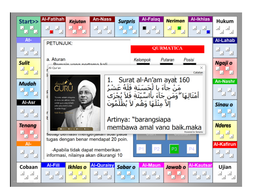
Picture 2. Display of Questions After The Player Occupies A Random Number Position

From the Qurmatica design, a material box is provided, all the teachers or clerics who is there, a place will be provided to edit the current material discussed. The contents of the box can be edited as desired. So the teachers or clerics in Islamic boarding schools can use Qurmatica according to mathematicss learning needs. In addition to these features, the game has a randomizer digital numbers and dialog boxes for the teachers or clerics for ask the attention from the students and can be directly typing in the dialog box and automatically save the text.